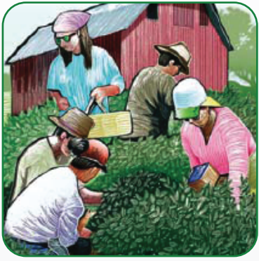
Eliminando Maleza a Mano Hand-Weeding

Identifique la imagen que muestra el tipo de trabajo o actividades que hace en el campo. Escoja todas las actividades que usted hace.