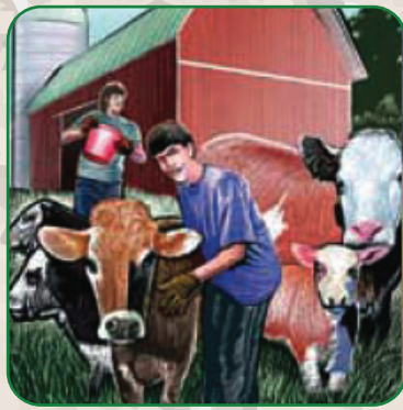
Trabajando con Animales Grandes Working with Large Animals