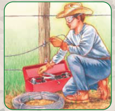
Reparación de Cercas Repairing a Fence