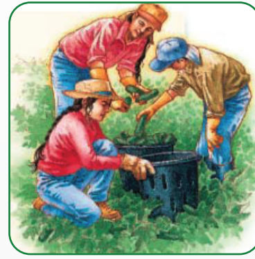
Cosechando a Mano Frutas y Vegetales Hand-Harvesting Fruits & Vegetables