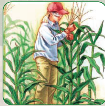
Cortando la Flor del Maíz Detasseling Corn