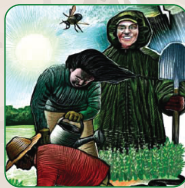
Trabajando Afuera Working Outside