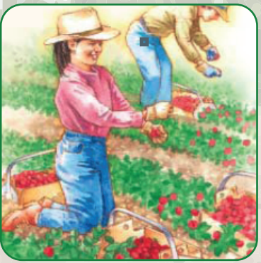
Cosechando Cultivos en Campo Harvesting Field Crops