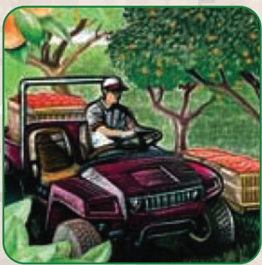
Operación/Conducción de Vehículos Operating/Driving a Vehicle