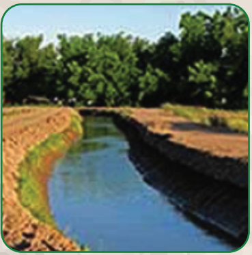
Trabajando Cerca del Agua Working Near Water