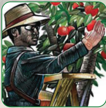
Cosechando Árboles Frutales Harvesting Tree Fruit