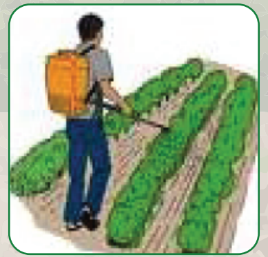
Applicando Pesticidas Pesticide Application