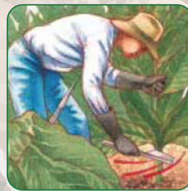
Cosechando Tabaco Harvesting Tobacco