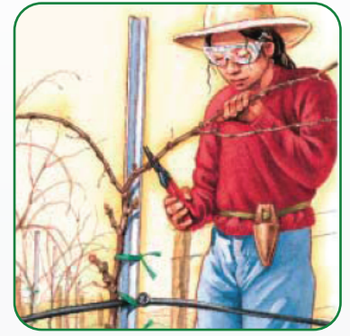
Podando Árboles y Viñas Pruning Trees and Vines