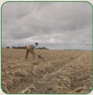
Trabajando Aislado Working in Isolation