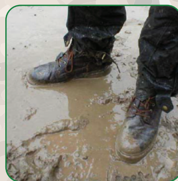
Trabajando en Áreas Húmedas Working in Wet Areas

MCN Migrant Clinicians Network www.migrantclinician.org