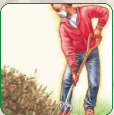
Trabajando en la Composta (abono vegetal) Composting