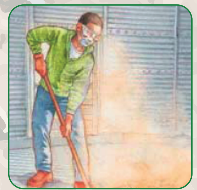
Trabajando con Granos/Paja Working with Grain/Hay