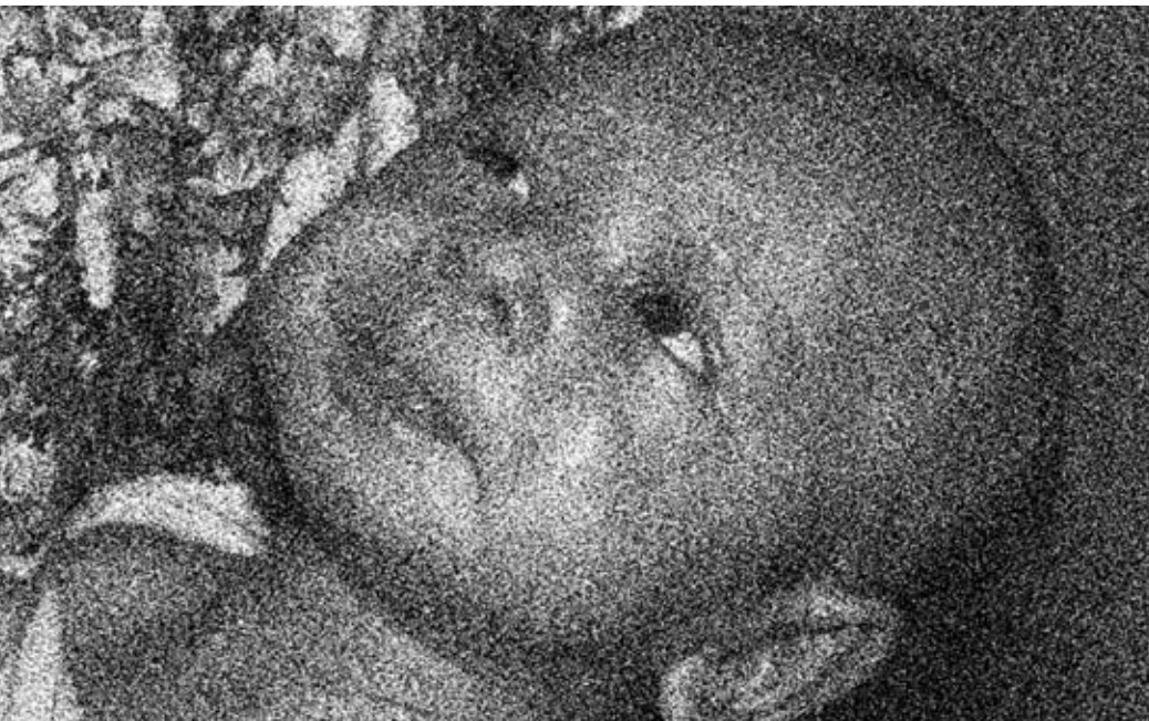
An early symptom of tetanus infection is risus sardonicus , consisting of a rigid 'smile', raised eyelids and wrinkled forehead.