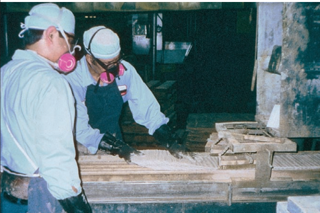
Battery-production workers face high lead exposure.

The OSHA lead standards provide inadequate protection to lead workers; the existing evidence is compelling that we are subjecting lead workers to too large a burden of risk for both acute and chronic health effects.