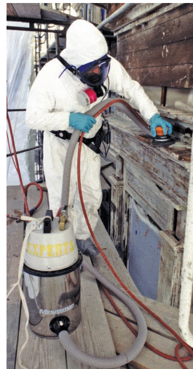
Protective gear and HEPA vacuums can reduce worker exposure.

In addition, unlike most environmental standards, the OSHA standards do not incorporate a margin of safety between the permissible exposure limit and the level associated with harmful effects on health.